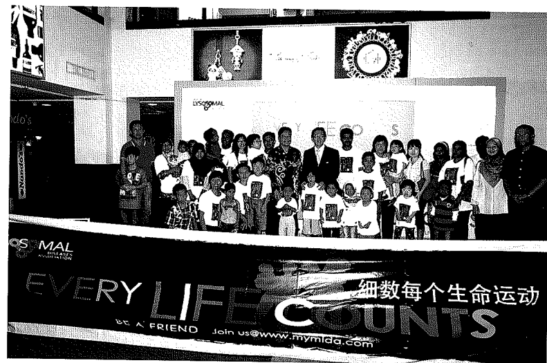
Launch of the Every Life Counts campaign by MLDA.

MLDA is a patient advocacy group committed to defending